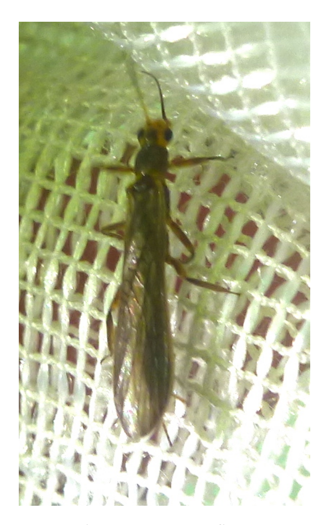
The Mystery Stonefly Stonefly larvae are prime fishing bait.